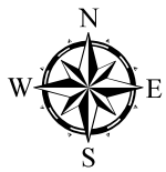
Figure 1 -- Sheet 5A of 5 Base map date: July 31, 2012 Refer to CTP document for more details